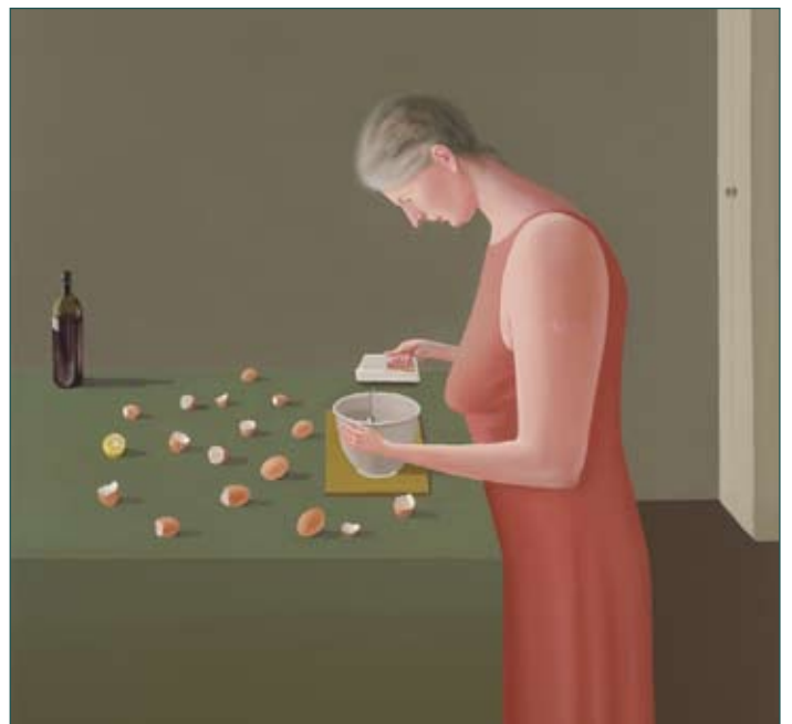
PRUDENCE FLINT Scrambled eggs 2010 oil on canvas Portia Geach Memorial Awardwinner 2010 © Prudence Flint