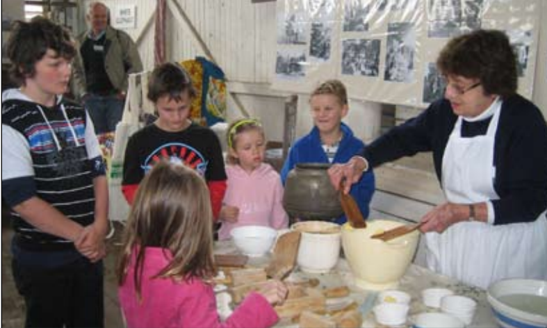
L: Butter-making during the recent Farm Day at Saumarez Homestead; one of many Trust events loved by children / R: visit Wild Scotland with Aurora Tours – see Trust News for details