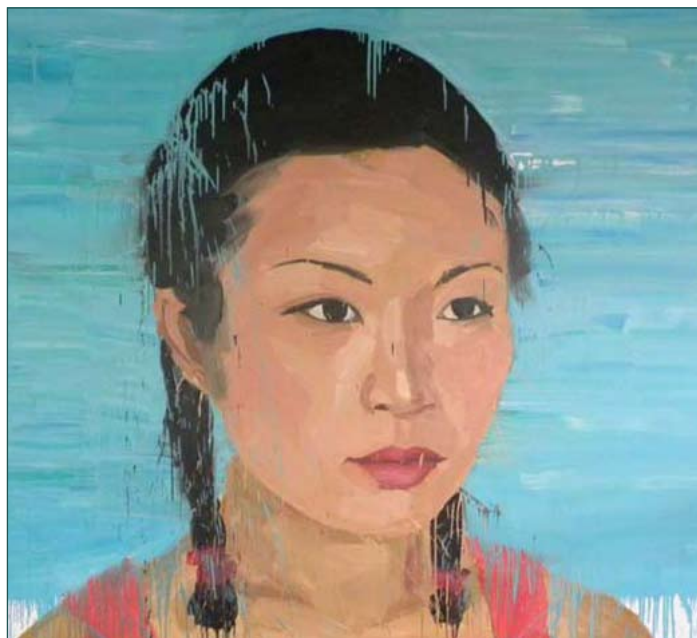
ZHONG CHEN: Poh (Portrait of Poh Lin Yeow) - detail, 2009 oil on linen, 190 x 120 cm. Courtesy the artist