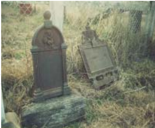
National Trust of Australia (NSW)

See the National Trust website at www.nsw.nationaltrust.org.au