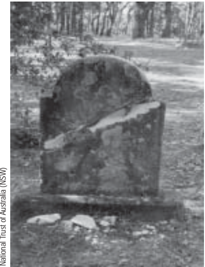
National Trust of Australia (NSW)

Recent sections of old cemeteries and even burial grounds with no 'old' monuments also provide valuable social documents of history and changes in taste, custom and design.