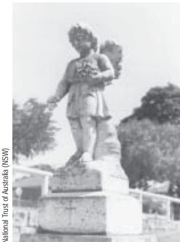
National Trust of Australia (NSW)