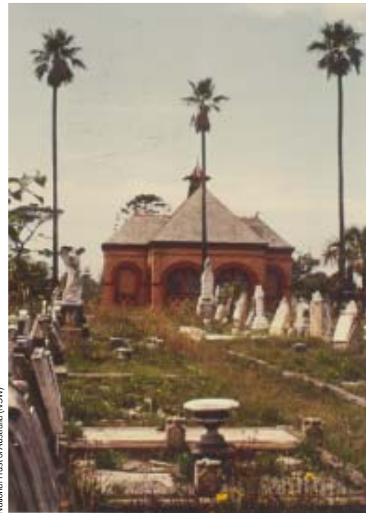
National Trust of Australia (NSW)

Conservation of cemeteries means retaining this significance.