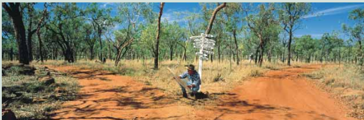
Exploring Outback Queensland.

The autumn leaves of New England are one of the geographic wonders of the world and to experience their beauty is an overwhelming experience. Although this tour will have an autumn theme there will also be an emphasis on the history, art and architecture of the area concentrated around the regions of Rhode Island, Massachusetts, Vermont, New Hampshire and Maine. Some of the wonderful sights which will be included are the amazing Newport Mansions near Providence, fossicking for antiques at Cape Cod, a visit to two of the best art museums in Boston, exploring beautiful small towns around Holden and Princeton, taste testing at maple syrup stalls, as well as a visit to