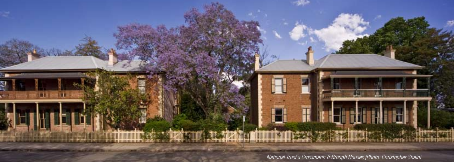
National Trust's Grossmann & Brough Houses