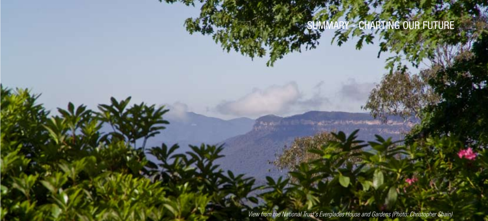
View from the National Trust's Everglades House and Gardens