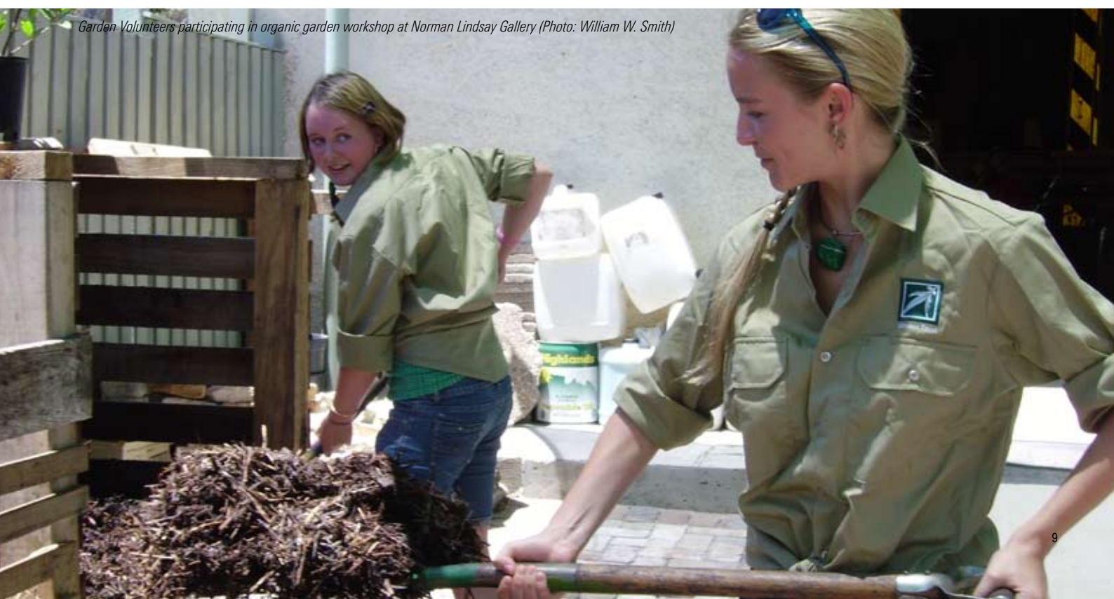
Garden Volunteers participating in organic garden workshop at Norman Lindsay Gallery