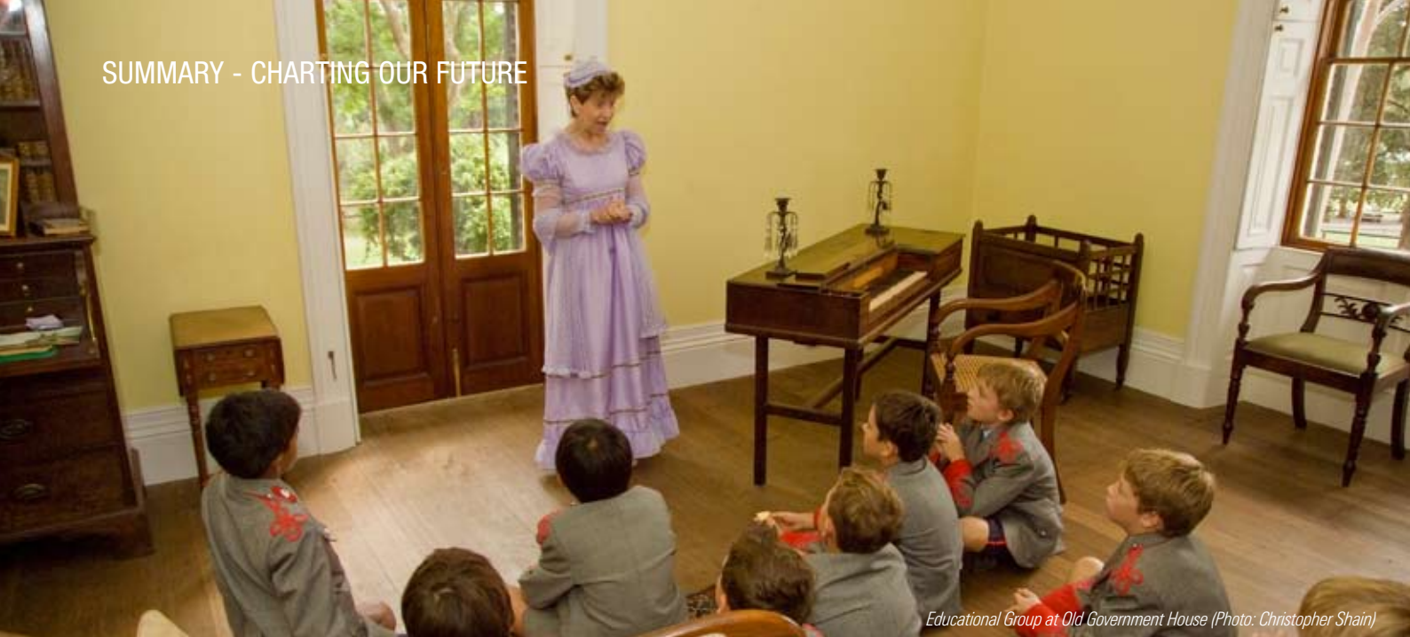
Educational Group at Old Government House