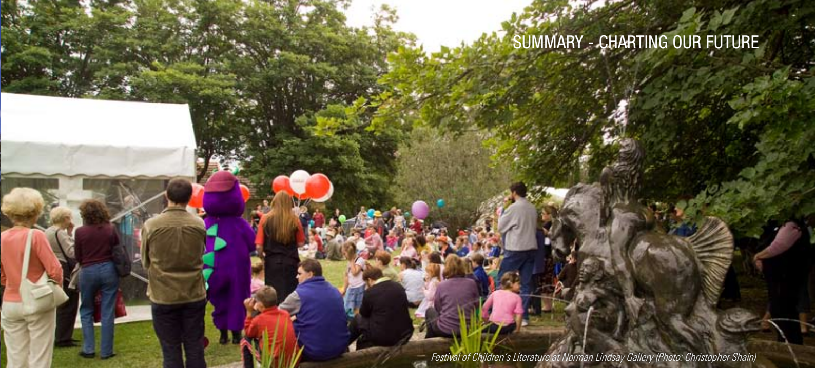
Festival of Children's Literature at Norman Lindsay Gallery