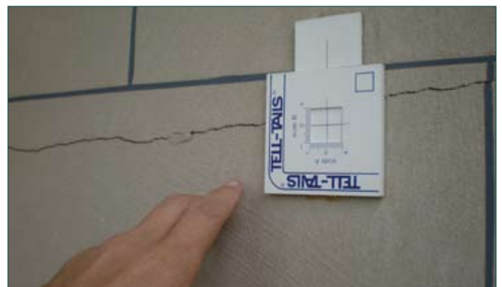
Tell-Tails monitoring device at Old Government House