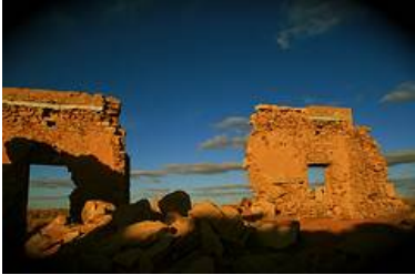
Farina Ruins SA, A2THAMFK