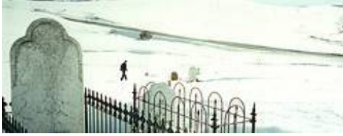
Winter at Kiandra NSW