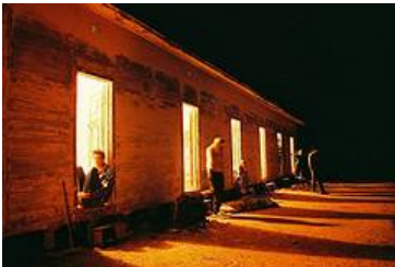
Old Shearer's Quarters VIC