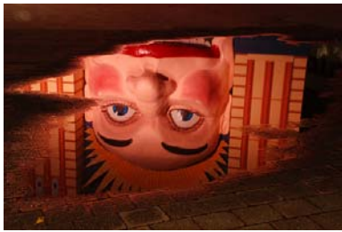
Luna Park NSW