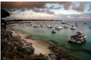
Dawn over Thompson's Bay, WA