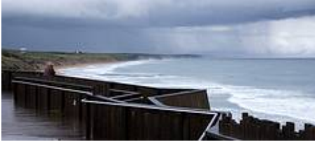
Logans Beach Whale Watching platform, Vic