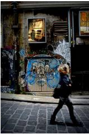
Hosier Lane Melbourne VIC