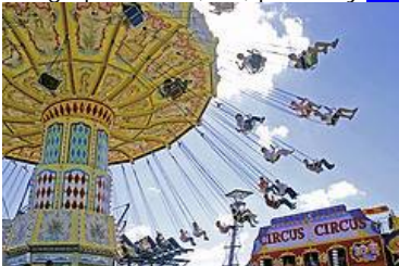
Wave Rider, NSW