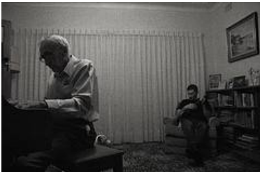
Simple Pleasures, NSW