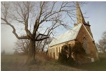
near Launceston