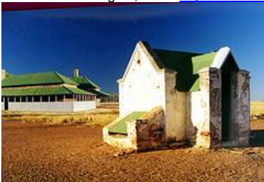
Telegraph Station, NT