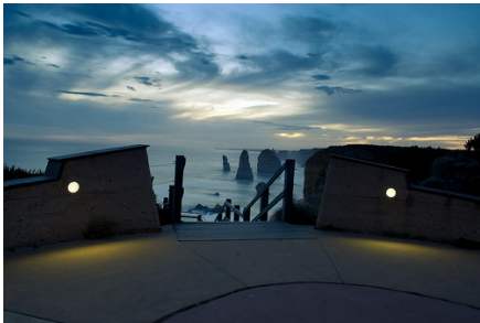
12 Apostles Boardwalk, Vic