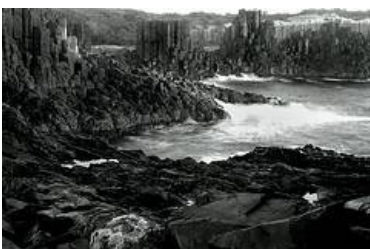
Bombo Quarry NSW