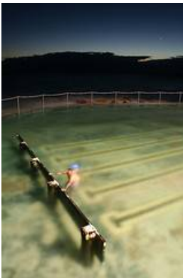
Life Aquatic, Sydney NSW