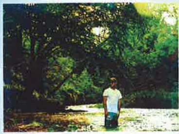
The billion dollar energy industry has a dirty little secret...

"DRAWS YOU IN IMMEDIATELY WITH AN INTIMACY AND QUIET NARRATIVE BY FOX'S CITIZEN JOURNALISM, WHO SLOWLY BUT SURELY UNCOVERS A PATH OF DESTRUCTION THAT IS CONTINUING AS I TYPE. AS YOU READ THIS, AND UNTIL BRAVE AND HONEST POLITICIANS CAN REMEDY WITH NEW LAWS THAT UNDO THE GREAT HARM." MONSTERS AND CRITICS