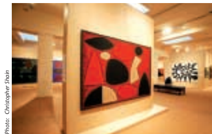
S H Ervin Gallery