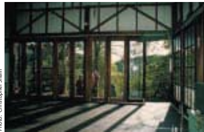
Hut of Happy Omen, Ahimsa