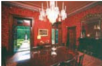
Polished silver, chandeliers and Georgian furniture at Lindesay