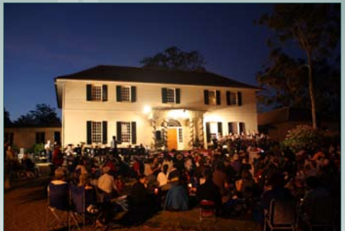
Carols by Candlelight, Old Government House