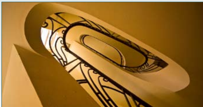
The staircase with its wrought iron Art Deco balustrade

Stage 1 of the grant included new and upgraded pathways to increase access to parts of the extensive gardens, and re-painting and carpeting of the 1930s house. Visitor experience at this spectacular property will be further enhanced by Stage 2 funding. This has enabled extensive garden maintenance, external interpretative signage and construction of a new Visitor Centre which will start in September 2010.