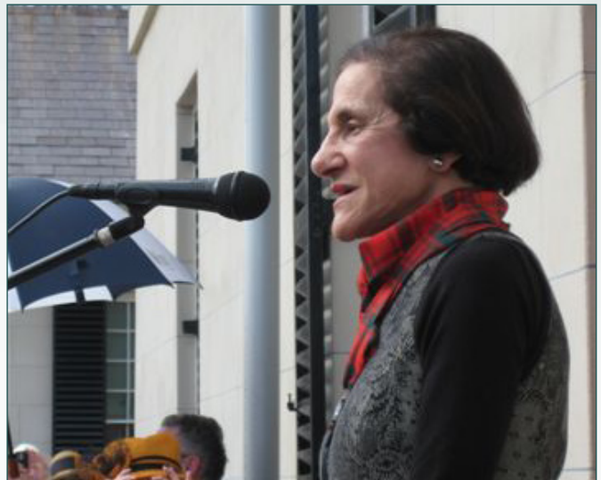
Her Excellency Professor Marie Bashir AC CVO, Patron of the NSW National Trust, gave a charming and inspiring address on the life and times of Lachlan Macquarie to a large gathering of guests at the September Gala Luncheon at Old Government House.