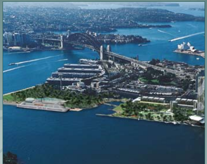
The National Trust's alternative concept for the Barangaroo site

The impact of rezoning. The Trust has campaigned tirelessly with the Ku-ring-gai community to protect the outstanding built and natural heritage of Ku-ring-gai from the impact of rezoning to increase housing density. The Trust welcomed the pledge by the Leader of the NSW Opposition to suspend the Ku-ring-gai Local Environment Plan (Town Centres), released in May this year immediately upon election to government.