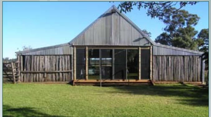
Dundullimal's woolshed, sensitively conserved and now an important regional facility

The conservation of the 1920s woolshed to re-use it as an all-weather education and function centre has created a much-needed community facility while considerably increasing the revenue potential of the property to set it firmly on the path to financial self-sufficiency.