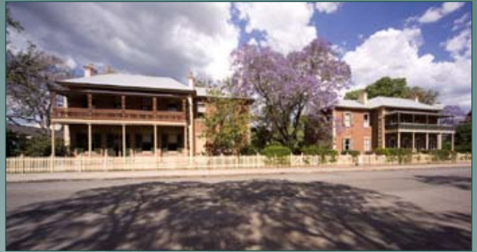
Grossmann and Brough Houses

The Trust's Bushland Services are a cornerstone in our commitment to achieving sustainability of our natural heritage while also directly helping communities and individuals. This year, the Trust's commitment to the preservation of the natural environment and native flora and fauna was emphasised by the creation of the Natural Heritage Department of the Trust.