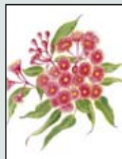
Eucalyptus Summer Red Designed by Lavinia Cuming