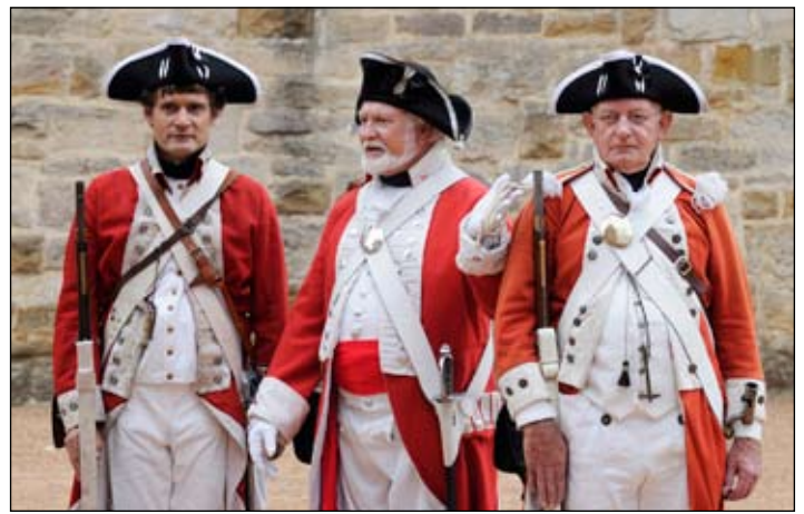
Redcoats at the launch of the Macquarie Thematic Listings