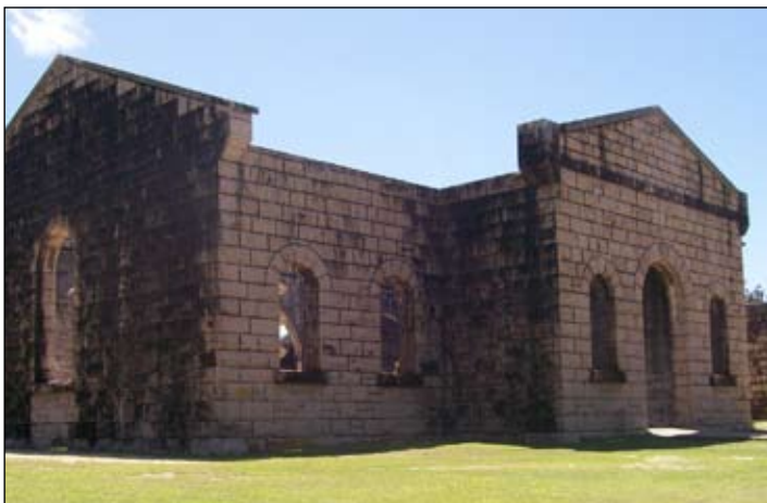
Trial Bay Gaol