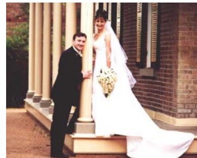
(Top and middle photos: